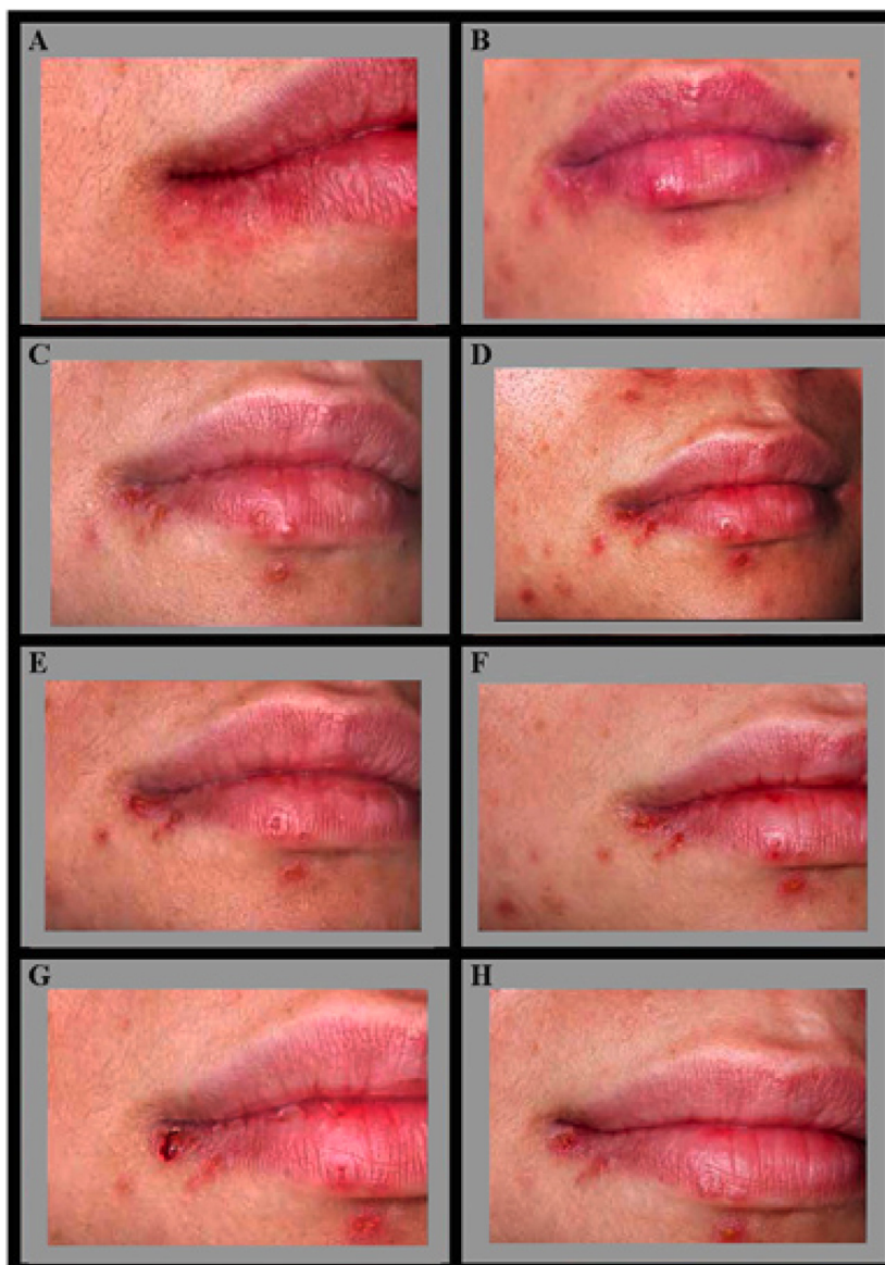
Fig. (3). Photographs of upper and lower lips of patient #3 at day 0 (A), day 1 (B), day 2 (C), day 3 (D), day 4 (E), day 5 (F), day 6 (G), and day 7 (H) treated with vehicle only. Photos were taken by the patient in the clinic.